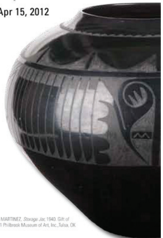
MARIA & JULIAN MARTINEZ, Storage Jar, 1940. Gift of Clark Field

PHILBROOK MUSEUM OF ART www.philbrook.org