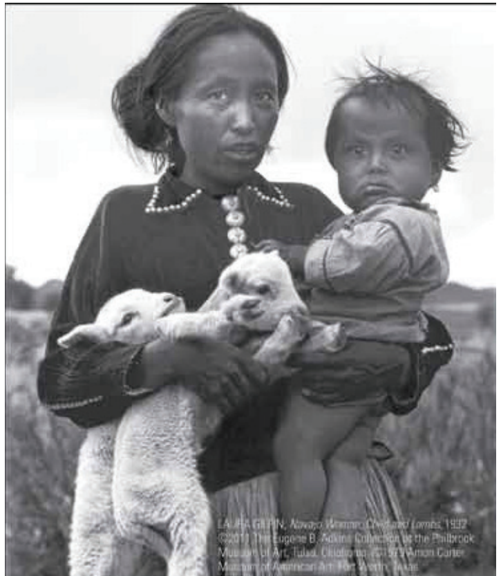
L.A. GILPIN, Adovajo Woman, Child and Lamb, 1922